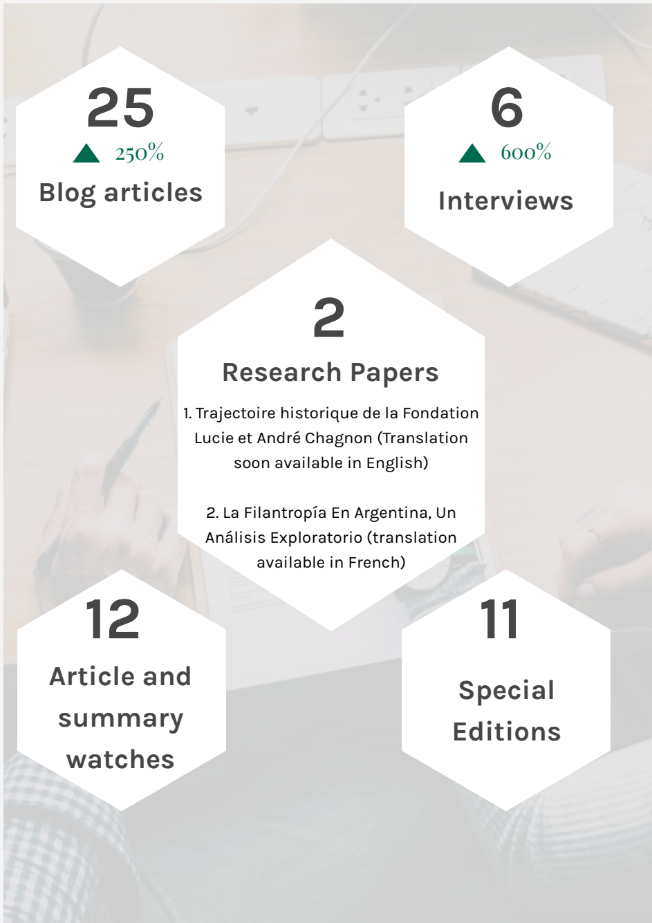
Percentages represent changes since 2017

PhiLab's publications include research papers, blog articles, interviews with the sector's actors, a watch of philanthropic resources (PhiLibrary) and theme-oriented monthly issues.